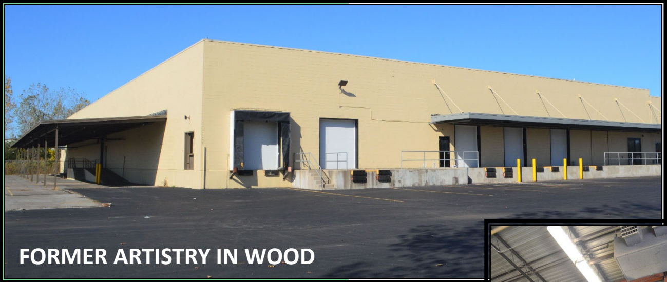
FORMER ARTISTRY IN WOOD